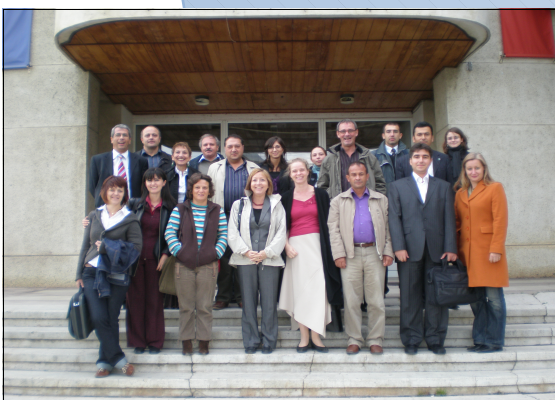
TRAMA Project Partnership Meeting in Rumania